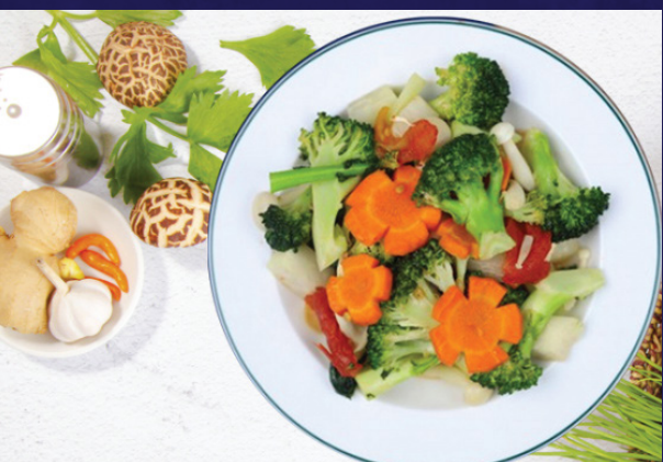
RAU XÀO HẠT ĐIỀU STIR-FRIED VEGETABLES WITH CASHEWS Xúp Lơ Xanh - Trắng, Cà Rốt, Đậu Pháp, Hạt Điều Green Cauliflower - White, Carrot, French Beans, Cashews.