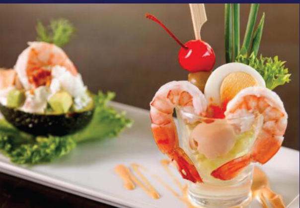
TÔM SỐT HỒ MẬN ĐÀO SHRIMP WITH PEACH & PLUMS SOUCE Tôm, Sốt Mận Đào Shrimp, Peach & Plums Sauce