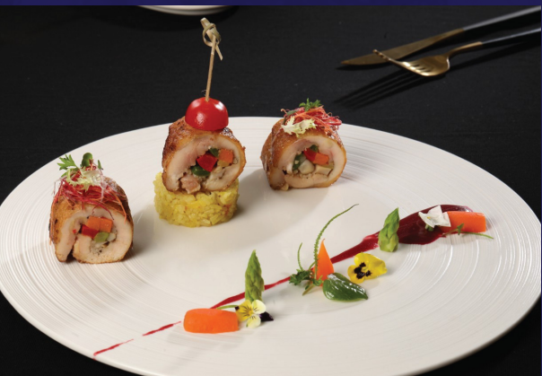
CƠM RANG ĐÙI GÀ CHIÊN MẮM FRIED RICE WITH CHECKEN THIGHS Cơm Rang, Trứng Gà, Đùi Gà, Sốt Đặc Biệt Fried Rice, Chicken Thigh, Sauce